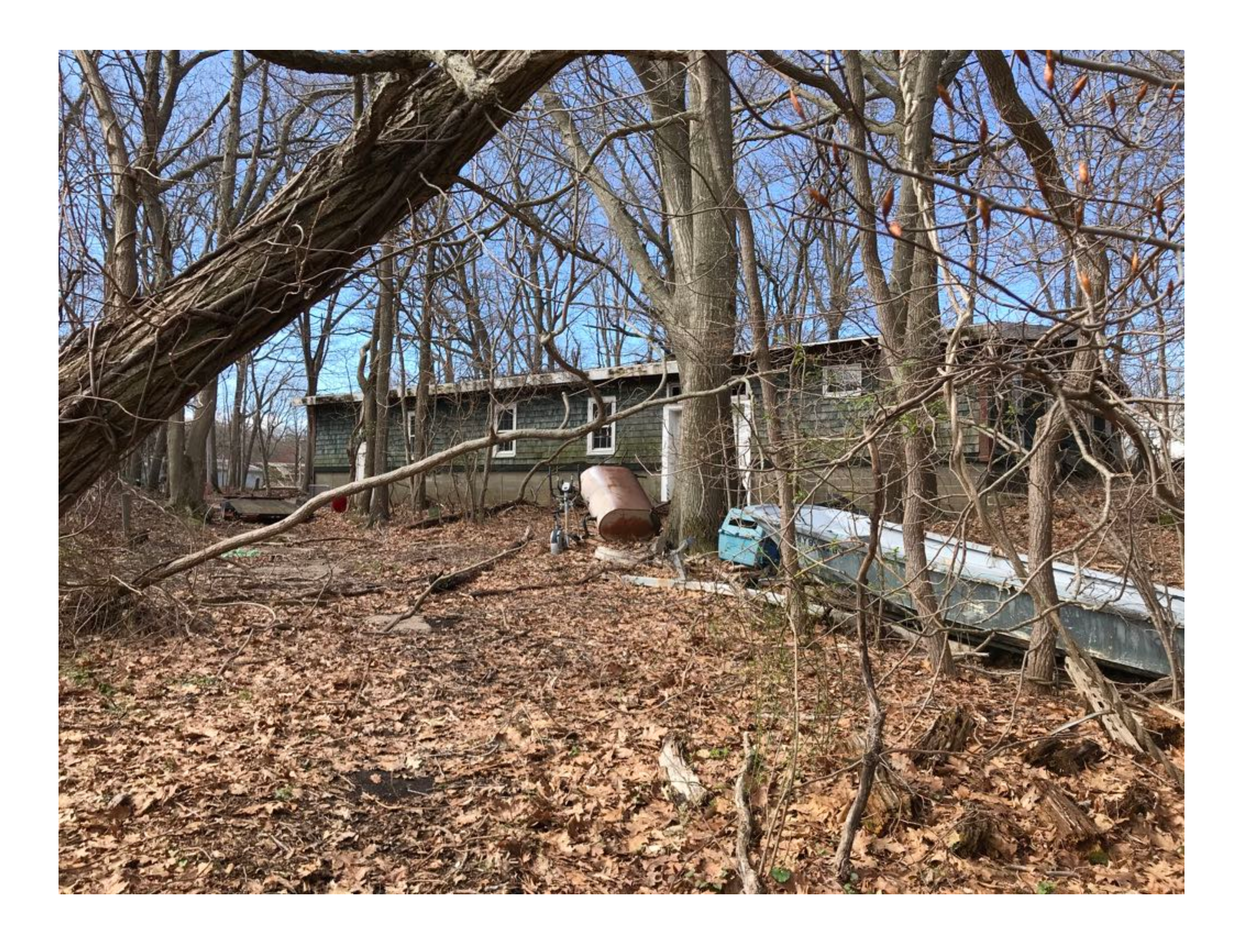
View of Bldg. #10 from bridge, storage for Village & hides view of Hawkeye Private Power Plant [not the site of a mystery as its name implies].