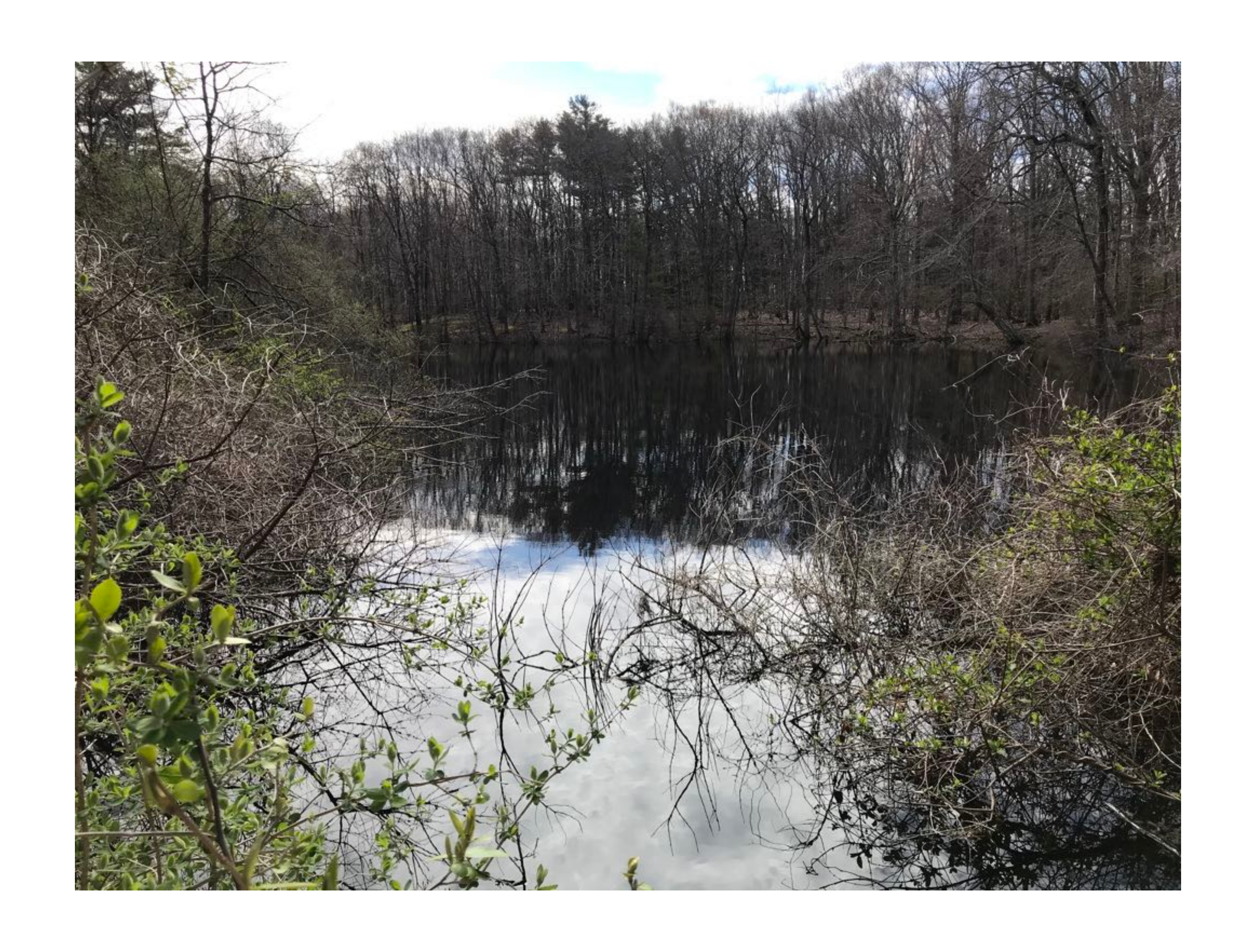
Magical and hidden view of reservoir.