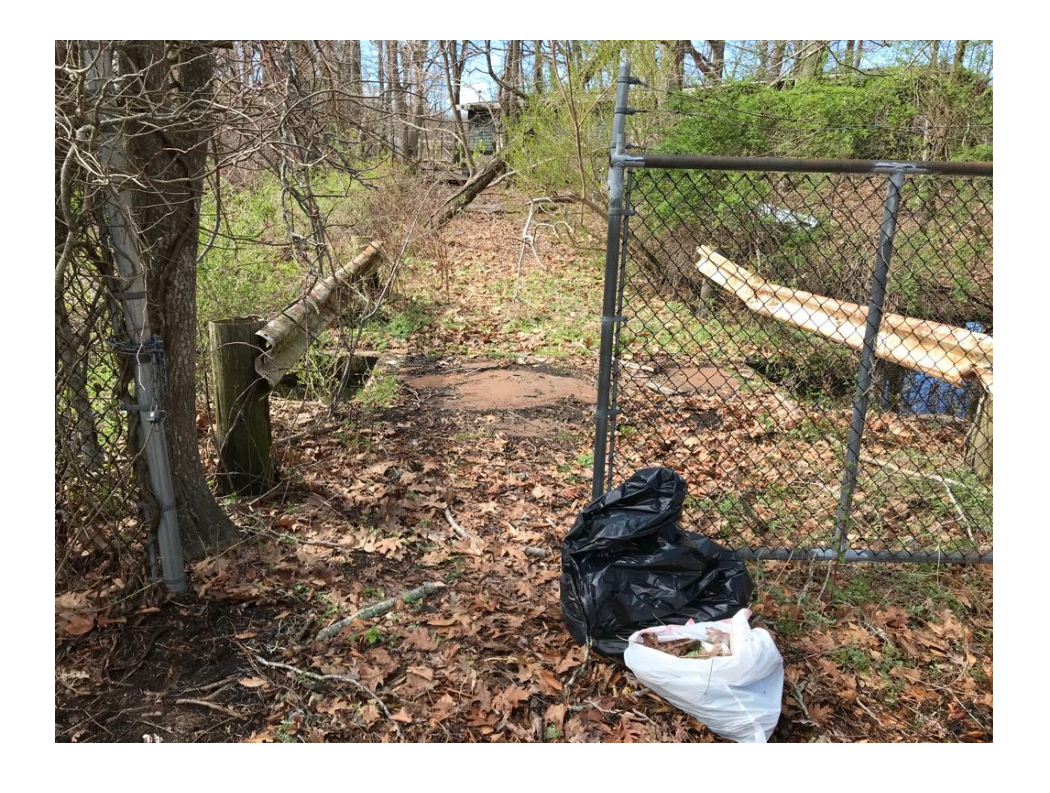
View of bridge to Building #10 from open field where telephone poles are stored