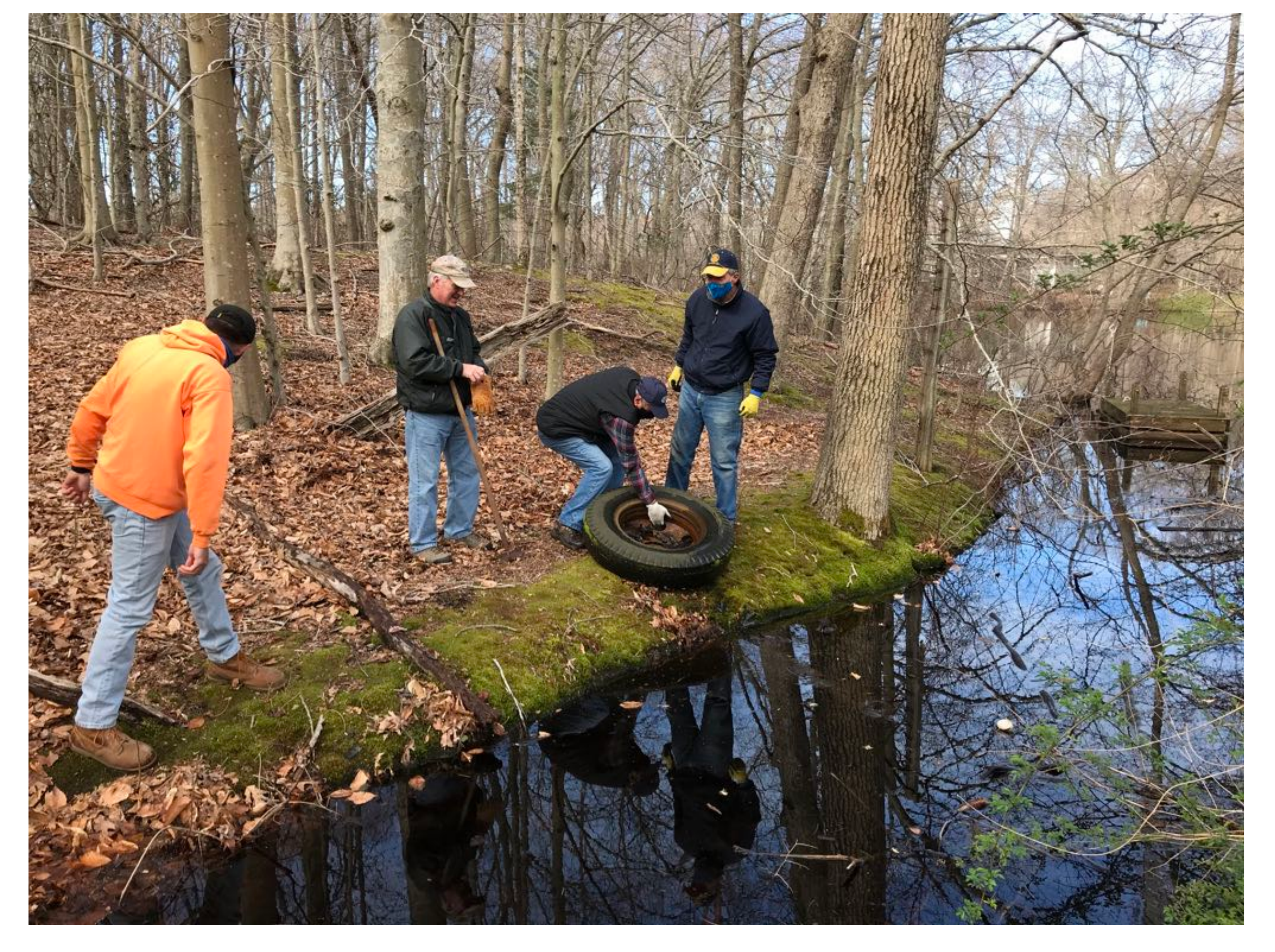
Rotary volunteers just pulled this out of the water along Moores Lane's west path