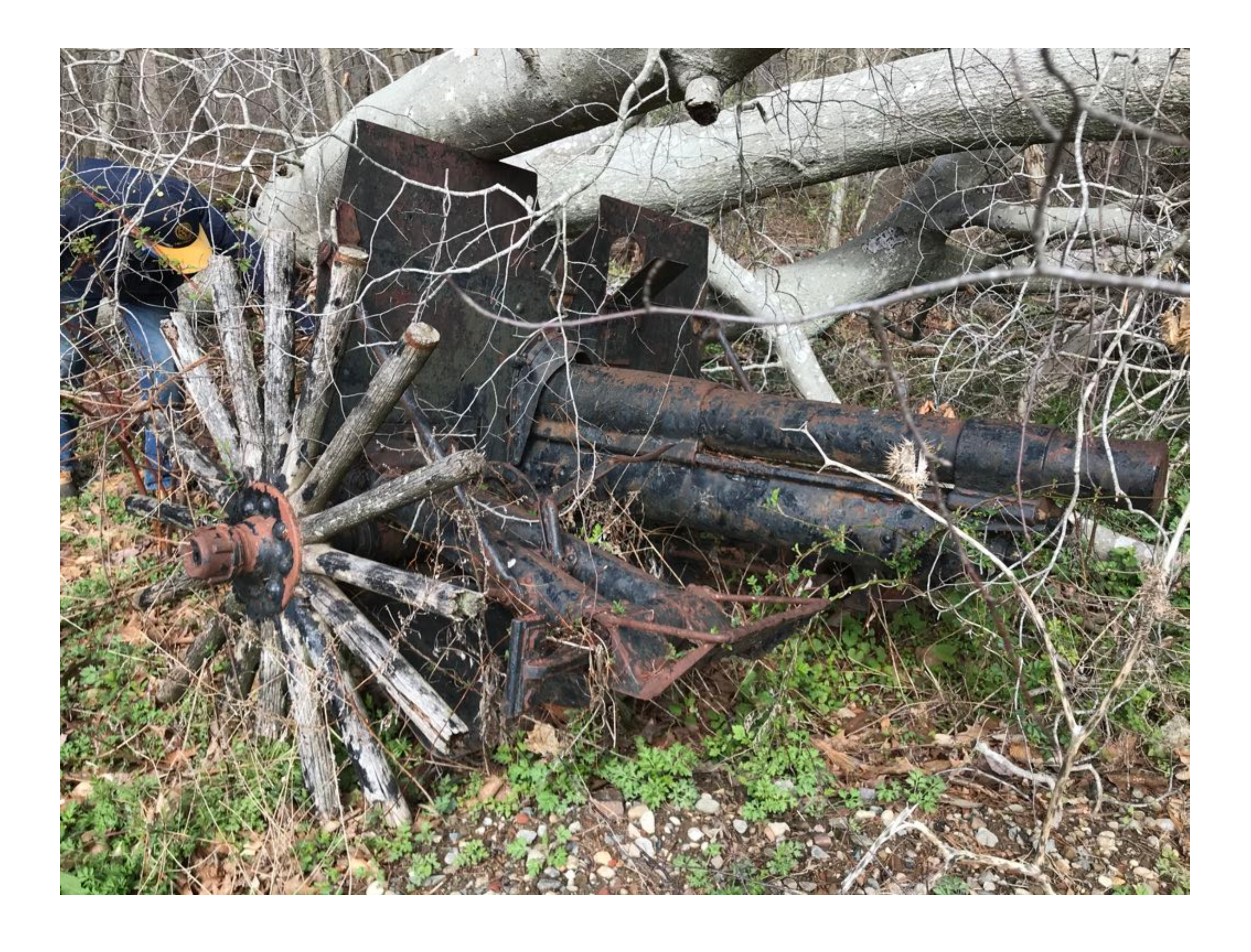
Volunteers excited to find a WWI howitzer holding up a fallen tree in the field north of west side reservoir. It used to grace the front of the Legion Hall.